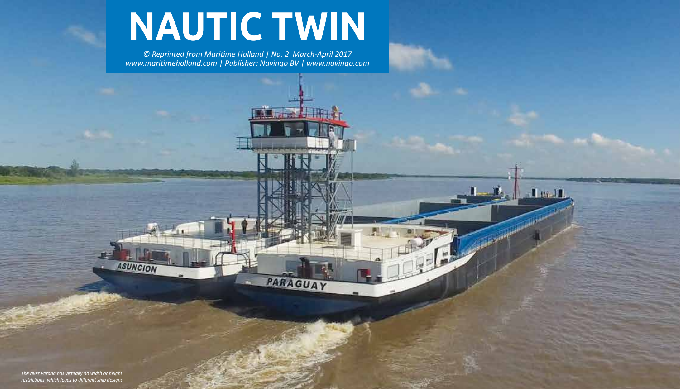
The river Paraná has virtually no width or height restrictions, which leads to different ship designs

The huge inland shipping potential in South America has long been on the radar of Concordia Group. There are wide navigable rivers, landlocked countries with large transportation needs and the competition of road transport is much less present, mainly due to customs formalities when crossing borders. Dutch ship owner Concordia Group saw this potential and - partly inspired by the downturn in Europe - shipped two of its China-built hulls for inland cargo vessels to Brazil. The plan was to finish the vessels locally and set up a container shipping line on the Amazon River in the North of Brazil.