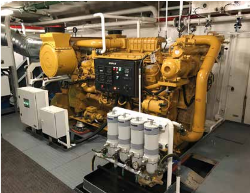
The gigantic Nautic Twin is powered by only two main engines

capacity on the river. Due to the currents, sandbanks shift regularly. Nautic Twin is equipped with four depth sounders, but in shallow parts of the river that is not enough. A smaller boat is then launched, which monitors the depth in front of the vessel and indicates where the deepest channel is located. In spite of her huge size, Nautic