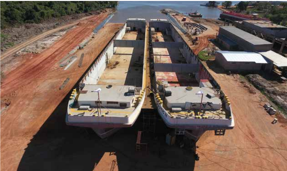
Nautic Twin is not a catamaran, but was built by joining two hulls together over their full depth

coamings were raised. These coamings also contribute to the strength of the vessel, and allow the vessel to sail without cargo hatches (open top notation). While ballast is not needed for stability or propeller immersion, some ballast capacity is provided to allow the vessel to be trimmed accurately. A connection was made between both engine rooms to create easy passage from side to side.